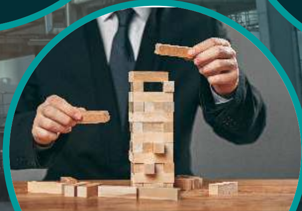
50+ years of proficiency