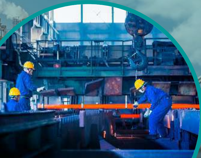
Amalgamation of Traditional & Modern lookout